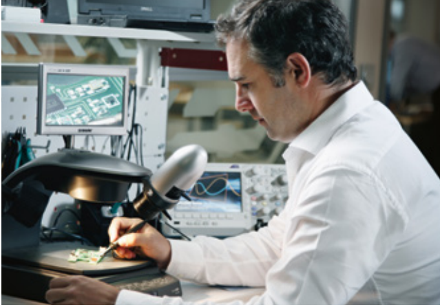
Component testing in R&D department