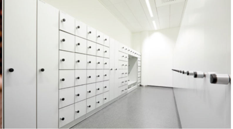
XS4 GEO cylinder