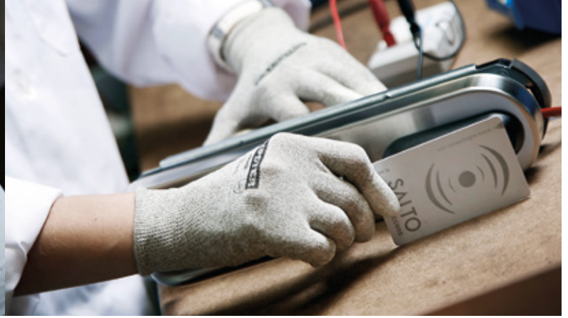
Functional test in manufacturing