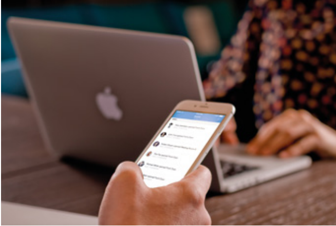
Visualization of the access events in different buildings through SALTO KS cloud technology