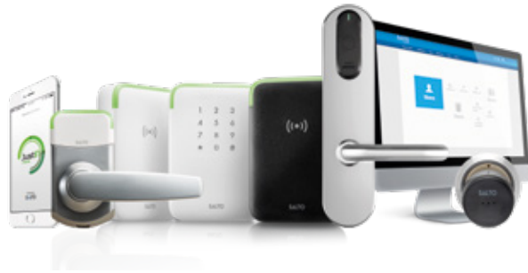
XS4 2.0 platform - the new standard in access control